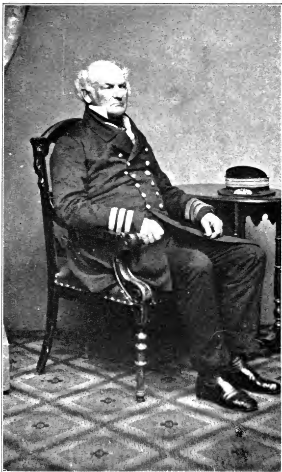
HIRAM PAULDING Commodore, U. S. N. About 1857